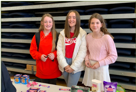
Charity and Fundraising Activities