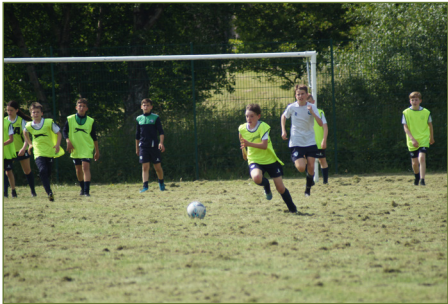
Boys' and Girls' Football Teams