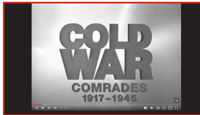
The Cold War

https://youtube.com/playlist?list=PL3H6z037pboGWTxs3xGP7HRGrQ5dOQdGc