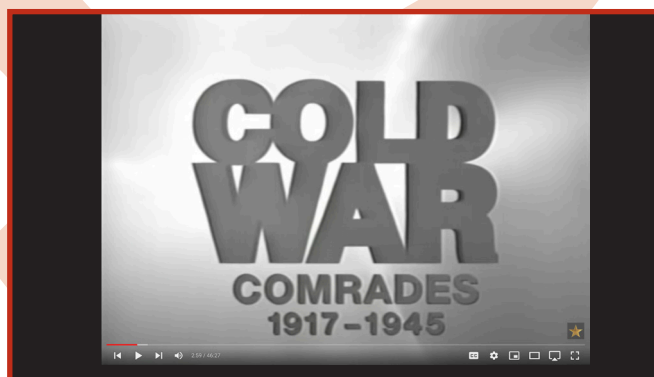
The Cold War https://youtube.com/playlist?list=PL3H6z037pboGWTxs3xGP7HRGrQ5dOQdGc

The Cold War – BBC/CNN Documentary Playlist.