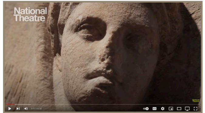
An Introduction to Greek Tragedy