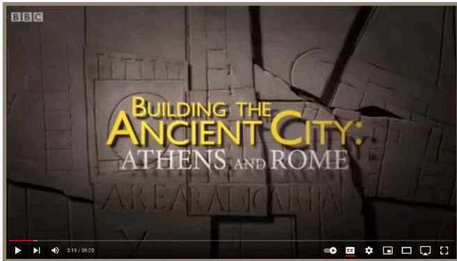
Building the Ancient City: Athens and Rome

Watch at least one Classical Civilisation related programme: