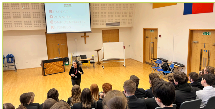
The Sixth Form spirituality day began with a session from the Respect Me team

In the first week of the Spring half term we had a drop down day which focused on PSHE and Core RE.