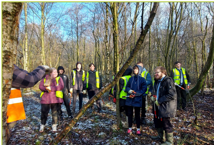
Thinning out the trees at Whinney Hill with the Prospects Foundation Team