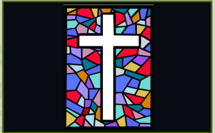
Way Maker by Jesus Image