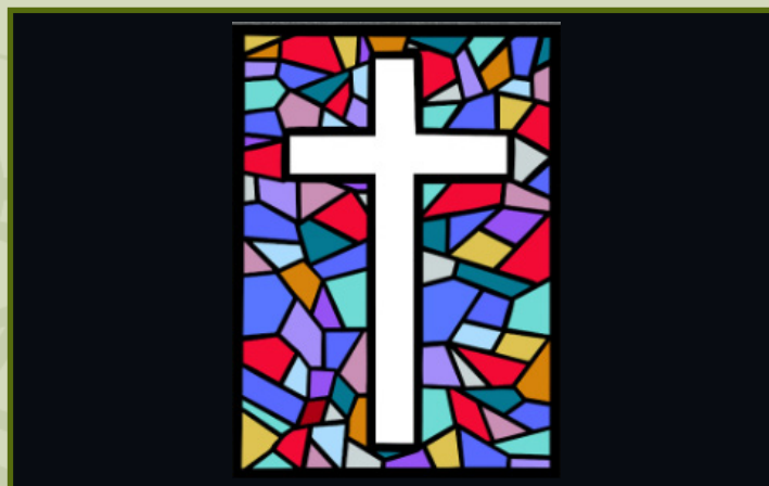
Hold My Heart by Tenth Avenue North