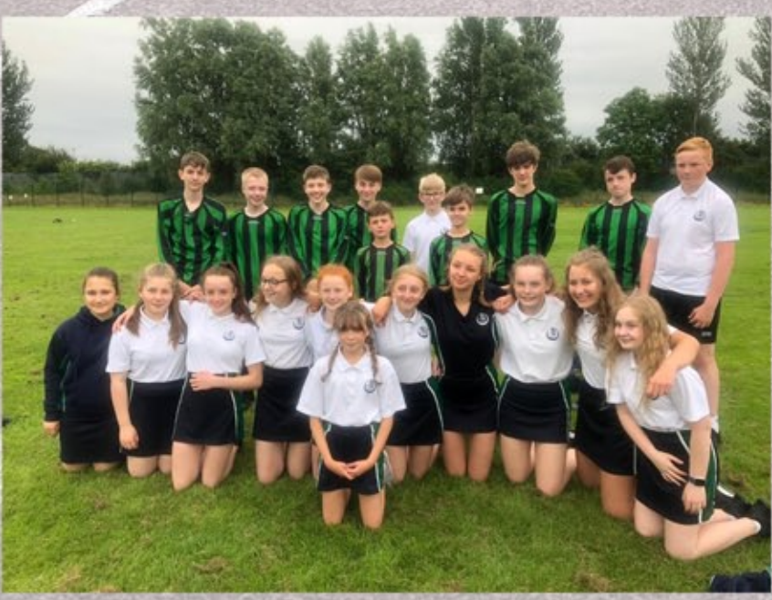
Also congratulations to 8VB (below) who took the Year 8 title. Well done!