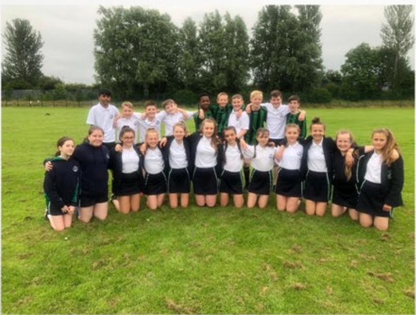
Congratulations to 7DU (above), the year 7 winners of Sports Day last week.