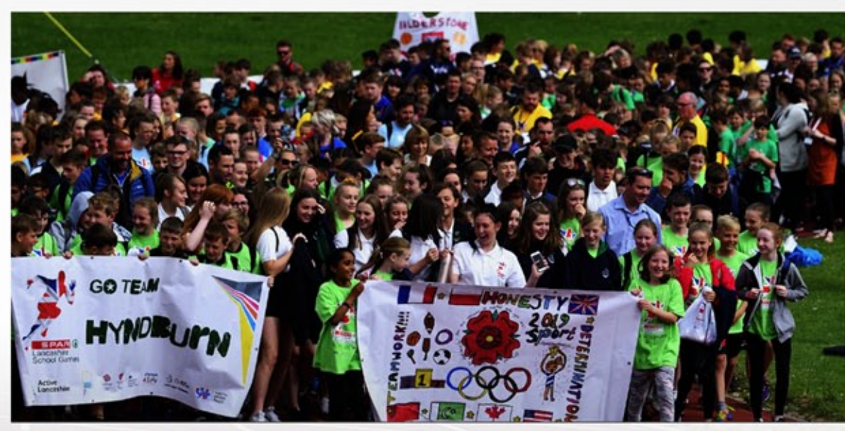
Well done to the Year 10 sports leaders who helped out with the running of the athletics during the Lancashire School Games.